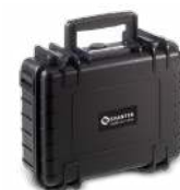
SA 147B Waterproof carrying case for dosimeter and docking station