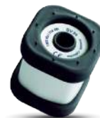
SV 34B Class 2 acoustic calibrator 114 dB at 1 kHz