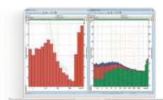
SF 104BIS_3OCT License of 1/1 & 1/3 octave