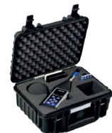
SA 72 Waterproof carrying case