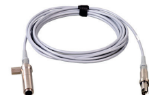
SC 91A Microphone Extension Cable