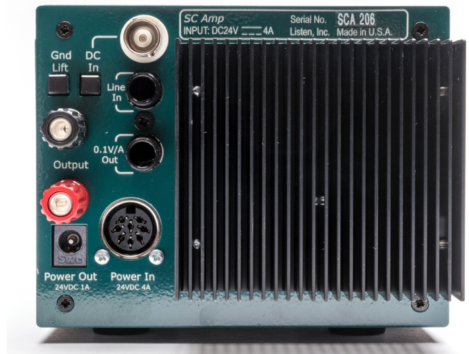
SC Amp Rear View

Rackmount shelf with mounting points for ¼ rack width Connect series products. Part # 4901