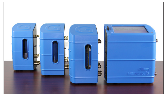
High, standard, & low flow cell modules are easily interchanged

The Gilibrator 3 can be configured to meet the user's calibration needs. The user may select between Continuous or Averaging modes. In Averaging mode, the user may select a sample set between 3 and 20 samples to be averaged. In addition, the user can define statistical parameters for Standard Deviation and percent deviation between sample sets. Within the settings screen, the user is able to define engineering units of measurement, date, time, temperature, and choose from a selection of languages in the devices library.