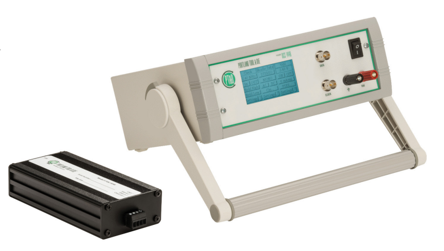
DCC-1448 (right) and PQC-3048 (left) Interfaces