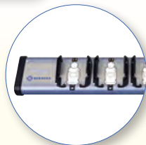
SA104-5 Docking Station for 5 Dosimeters