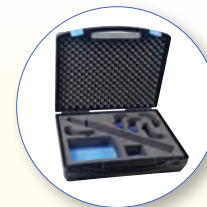
SA144 Carrying Case for 5 Dosimeters and Docking Station for 5 Units