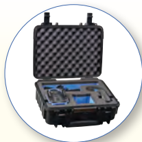
SA147 Waterproof Carrying Case for Noise Dosimeter and Single Docking Station