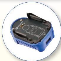
SA104-1 Docking Station for Single Dosimeter