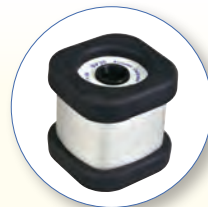
SV34 Class 2 Acoustic Calibrator 114 dB at 1 kHz