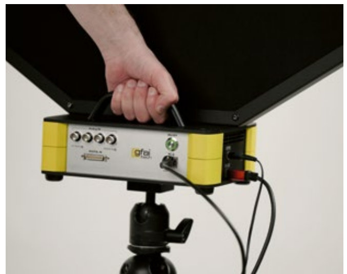
The Octagon can be placed on the ground or on a tripod

The fiber-carbon construction makes the octagon stable and light at the same time, integrated handles allow for an easy transport or handheld measurements. All these features make the Octagon the perfect system for a wide range of applications in R&D, quality assurance, maintenance or environmental acoustics.