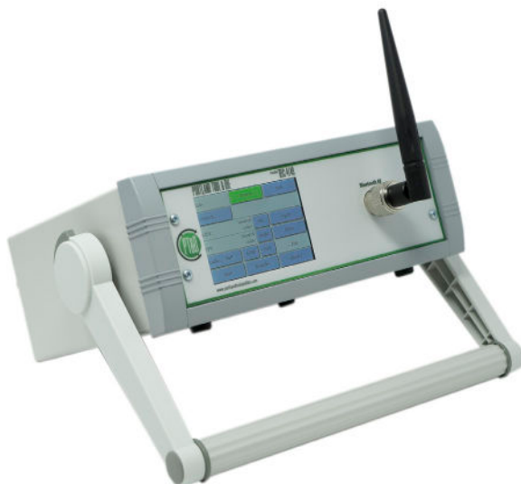
BTC-4149 Research Grade Bluetooth Interface