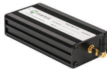
BQC-4149 Production Line Bluetooth Interface

Please note that the BTC-4149 and the BQC-4149 are updates to the earlier BTC-4148 and BQC-4148 models, and feature an updated bluetooth chip. The new 4149 versions ONLY work with SoundCheck version 17 and later; the older 4148 models work with SoundCheck versions 14 -16. Please contact a sales engineer to discuss compatibility in more detail before purchasing if you are not using the current version of SoundCheck.