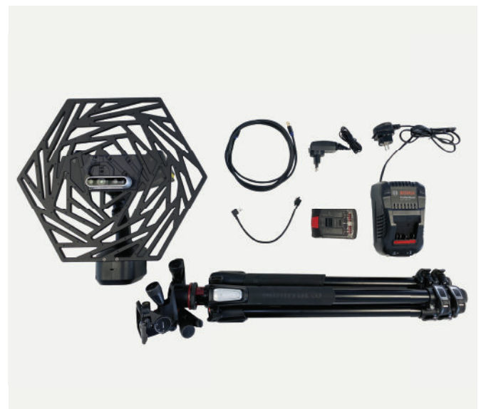
Acoustic Camera Mikado set with optional accessories

The array comes with an integrated Intel® RealSense™ depth camera which features Full HD resolution and the ability to record depth information.