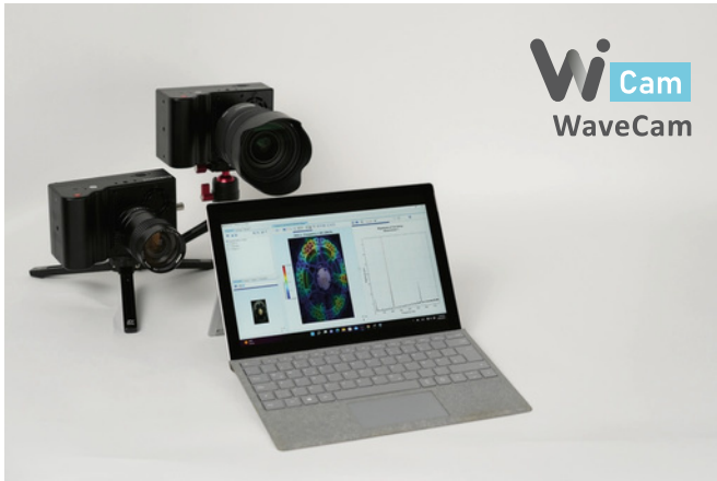
Highspeed cameras Chronos 1.4 and 2.1 with WaveCam soft ware by gfai tech

Optical flow based time and frequency ODS