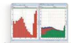
SF 971A_P1 Package 1/1 & 1/3 octave and audio recording