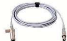
SC 91A Microphone Extension Cable