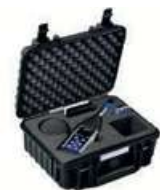
SA 72 Waterproof carrying case