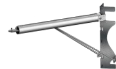
SA 306 Pole Mounting Bracket