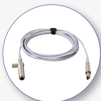
SC91 Microphone Extension Cable