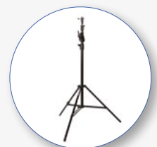
SA420B Tripod Up To 4 m Height