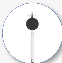
SA271 Microphone Outdoor Protection Kit