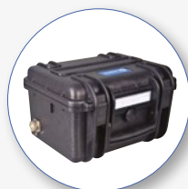
SM271 LITE Outdoor Monitoring Case