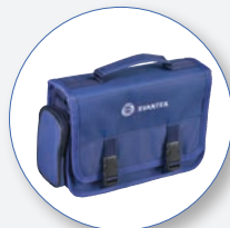
SA47M Carrying Bag Fabric Material