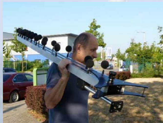
Star array folded during transport