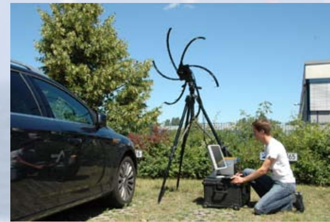
Dismountable star array in the field on the transport case