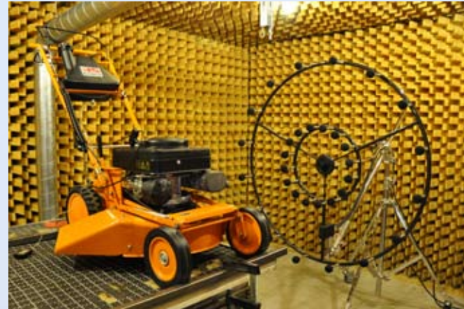
Double circle array during measurement in an anechoic chamber

The main advantage of conventional arrays with Tornado is the universal use of the measuring hardware with the detachable microphones (SMB connectors). The same hardware can also be used for sound power measurement according to the envelope area method or for a simulated Indoor Pass-By.