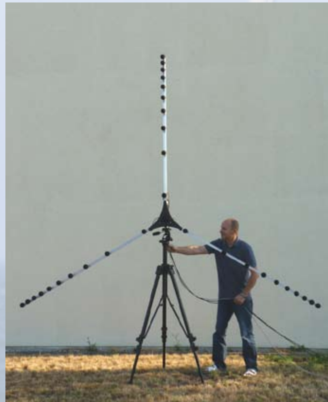
Star array in field use